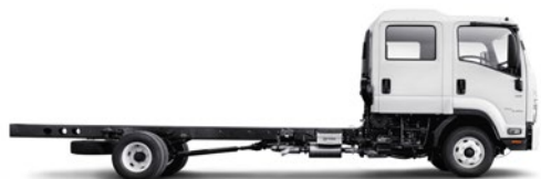
FRR 110-260 Crew