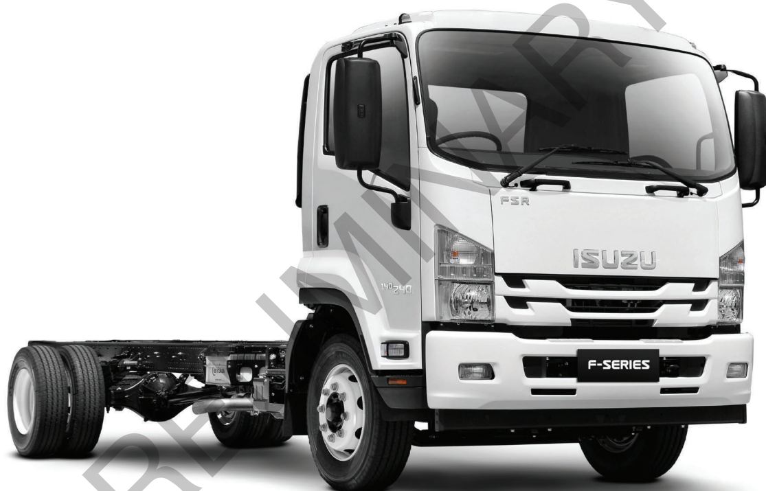
Image for illustrative purposes only. FSR 140-240 pictured.

* Satellite Navigation functions and maps provided at no extra cost, with up to four quarterly updates provided by user free download for the first three years of ownership, after which updates can be purchased at additional cost.