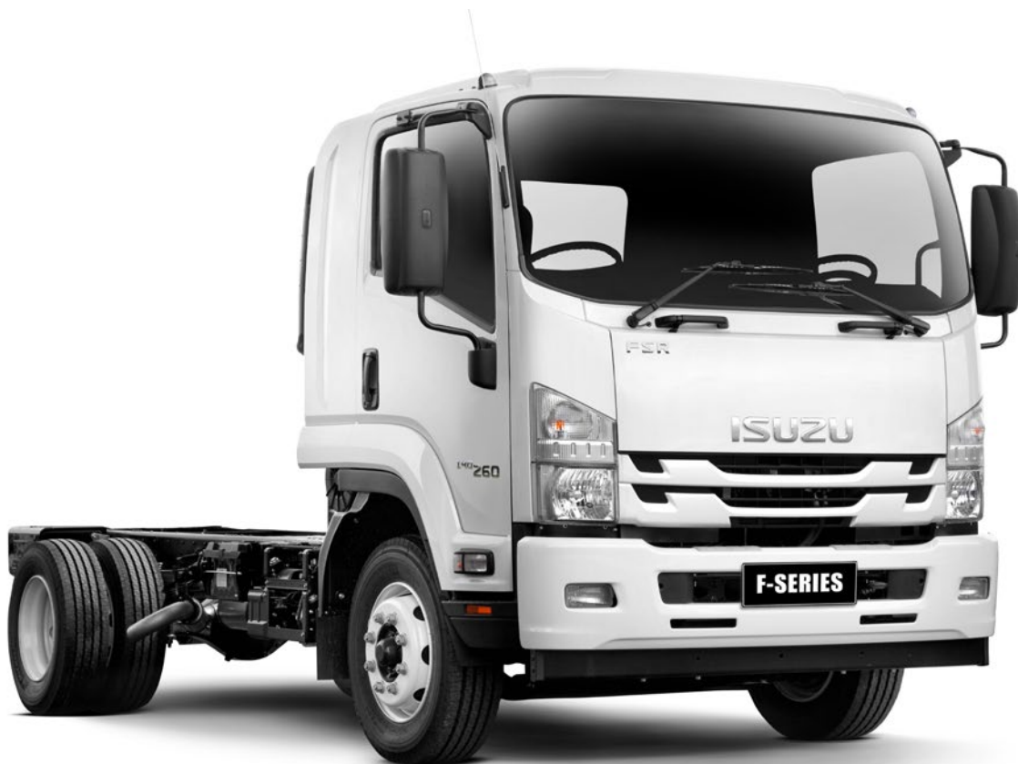
Image for illustrative purposes only. FSR 140-260 pictured.

* Satellite Navigation functions and maps provided at no extra cost, with up to four quarterly updates provided by user free download for the first three years of ownership, after which updates can be purchased at additional cost.