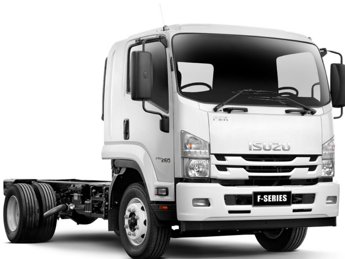
Image for illustrative purposes only. FSR 140-260 pictured.

* Satellite Navigation functions and maps provided at no extra cost, with up to four quarterly updates provided by user free download for the first three years of ownership, after which updates can be purchased at additional cost.