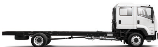
FTR 150-260 Crew