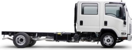
NPR 75-190 Crew