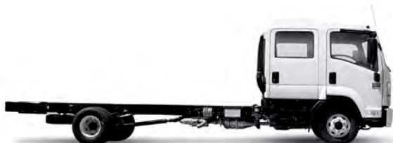
FRR 600 Crew