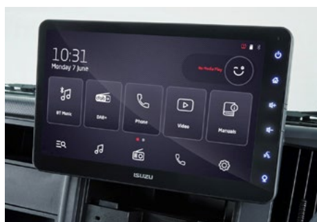
MyISUZU CO-PILOT audio visual unit.