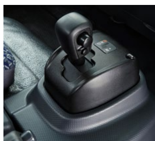
AMT model shown