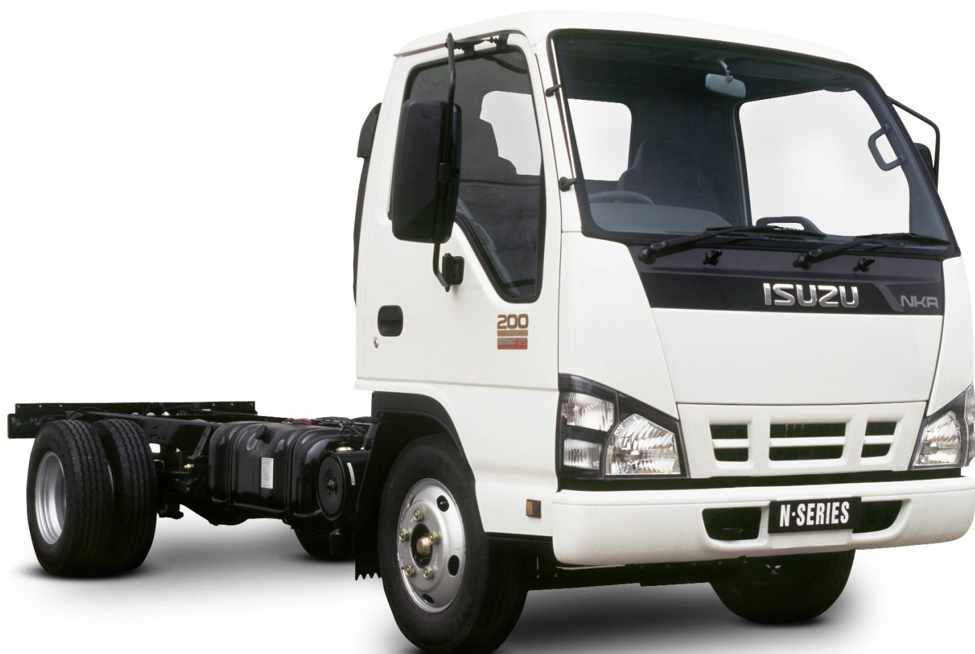
NKR 200 Medium pictured