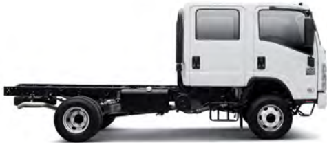
NPS 300 Crew